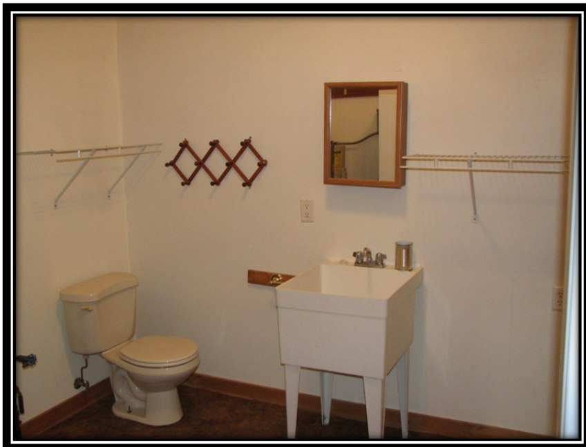
Half Bath & Laundry