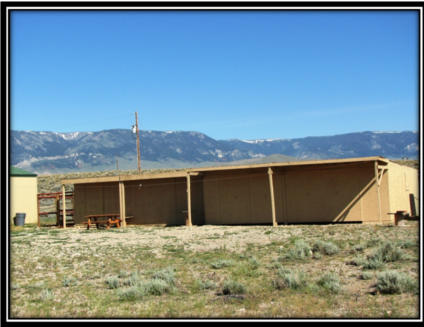
Garage - Storage