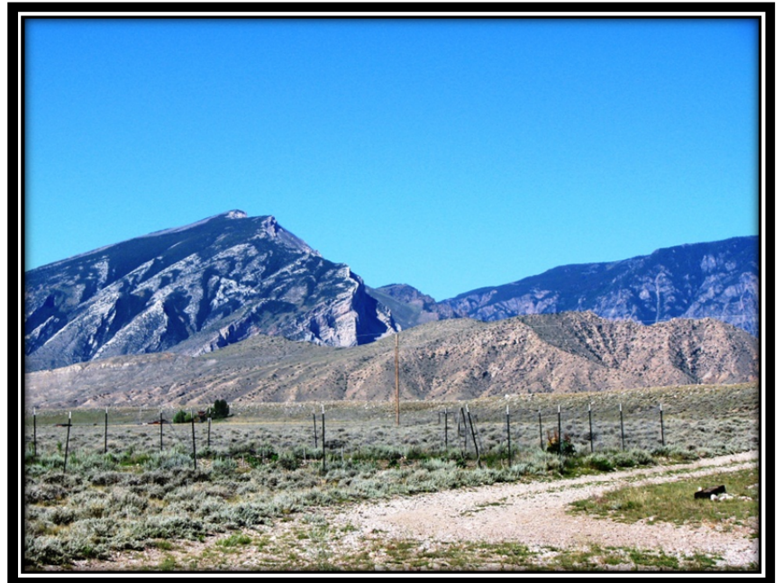
Clarks Fork Canyon