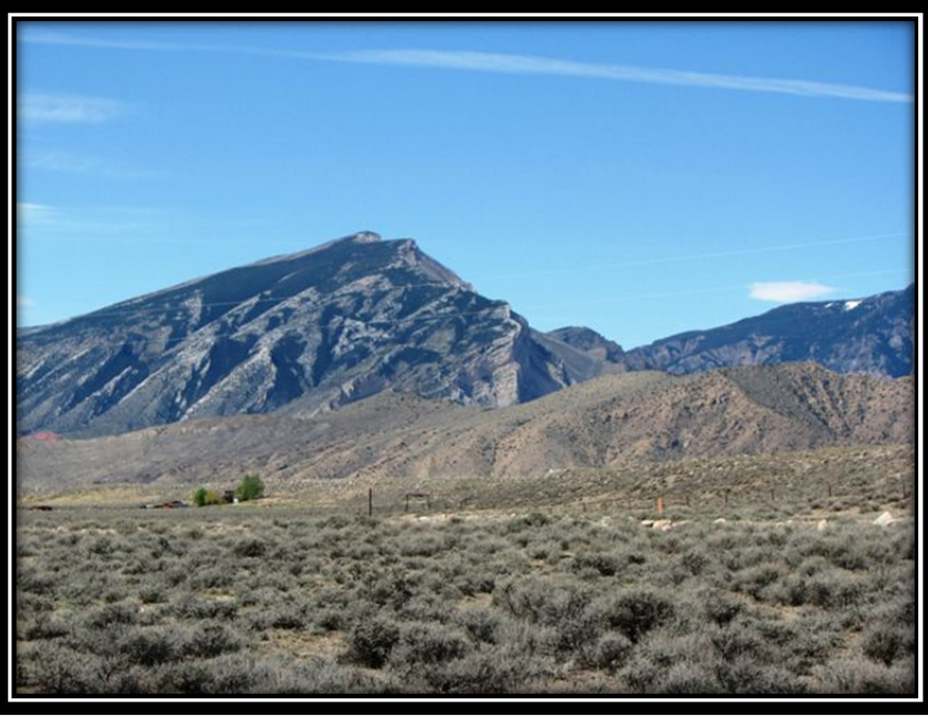
Clarks Fork Canyon